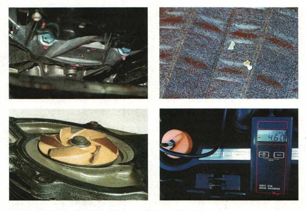
Clockwise from top left: Coolant leak from rear of Cayenne V8 and Tiptronic's torque converter area is sure sign of failed coolant pipes. Metallic fragments found in M96/996 oil filter. Worn M96 water pump. Manometer tests for crankcase vacuum; high reading indicates failing M96 air/oil separator.

rear fenders. Sometimes this unrepaired damage cannot be seen, but it can usually be felt: The technician puts a hand, palm down, on the rear fender arch; then, using a slow, front-to-back wiping motion, he feels for any flat spots or abrupt changes in the curvature of the arch. Bent rear fender wheel arches are very difficult for body shops to correct. Finding this damage usually is a surprise for the owners of these cars. The problem especially affects such wide-body cars as the 930, but this can also be present on any 911.